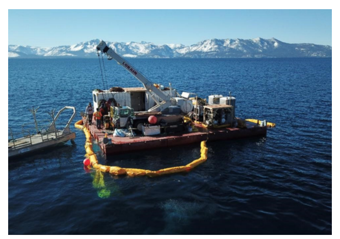
Sustainability & Sensitivity to Environment, History and/or Culture Cave Rock Water System Improvements Lake Work Intake