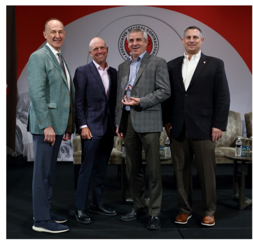
The Nevada Chapter was recognized by the AGC of America PAC for contributing the most dollars from a Chapter Board.