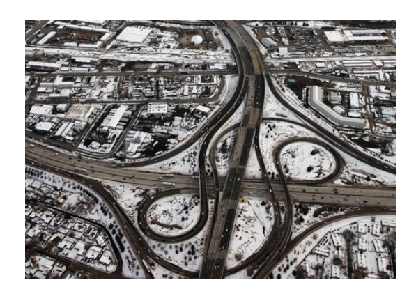
Contractor's Excellence Public Sector Over $10 Million Spaghetti Bowl Xpress