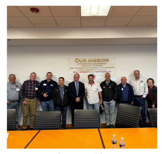
AGC members met with Governor Lombardo to discuss the 2023 session, industry priorities, and the 2024 election.