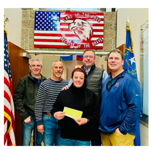
AGC Past Presidents donated $10,000 to the Tiny Toes Foundation, a local nonprofit offering support to families with a medically complex child.