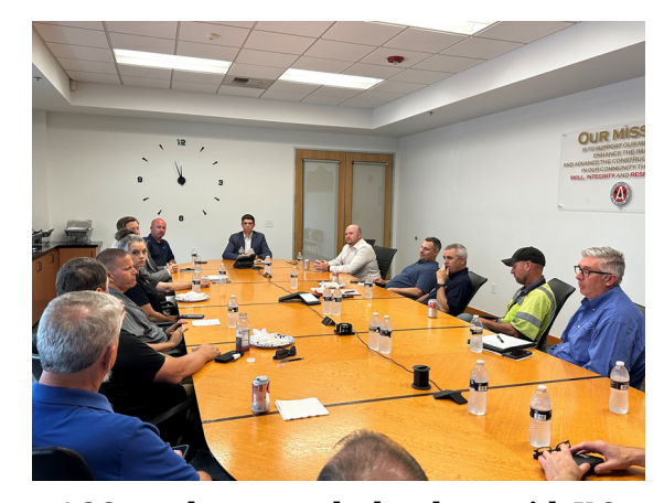
AGC members attend a luncheon with U.S. Senate candidate Sam Brown