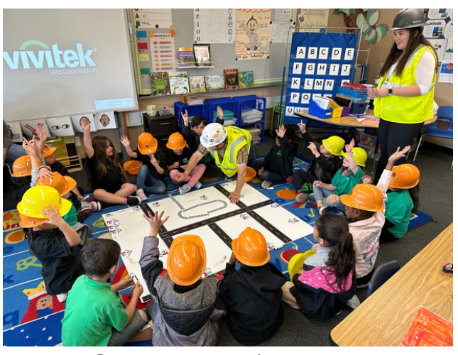
Lemelson Construction Career Day