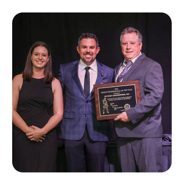
Design Professional Of The Year