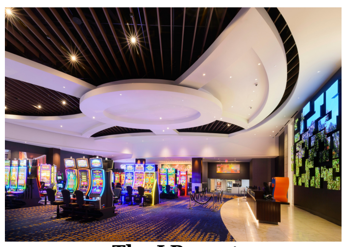
The J Resort