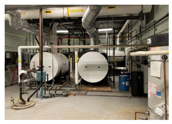
Contractor's Excellence Private Sector Under $1 Million Renown ATS#4 Replacement