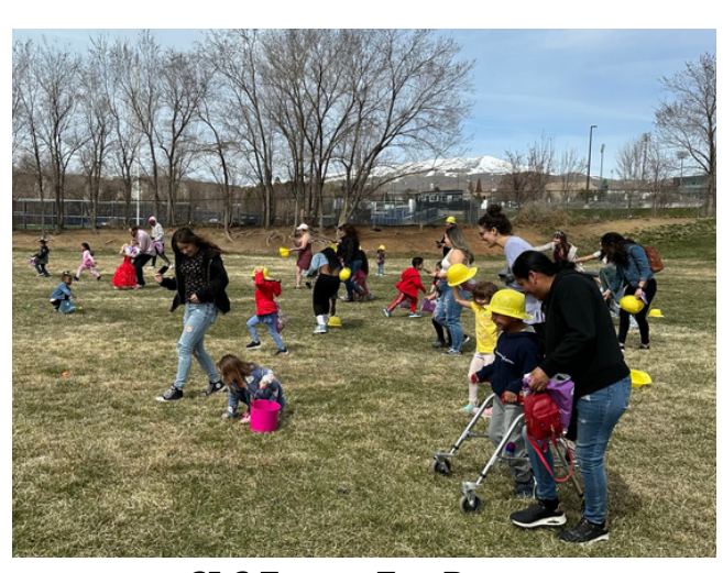
CLC Easter Egg Race