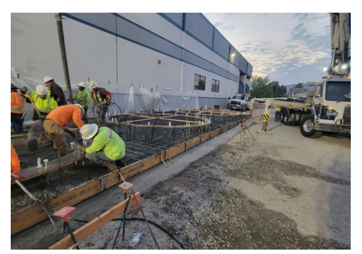
Hamilton Medical Center