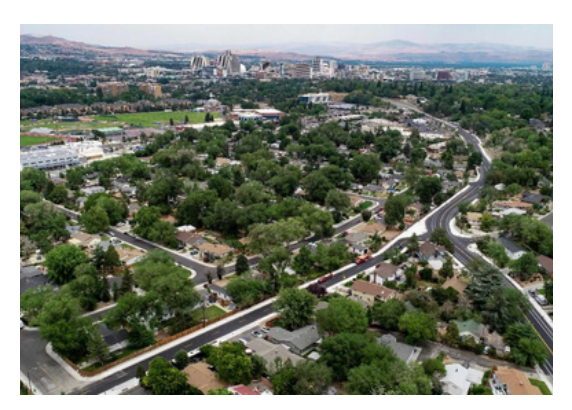
Contractor's Excellence Public Sector Under $10 Million RTC Consolidated California Avenue