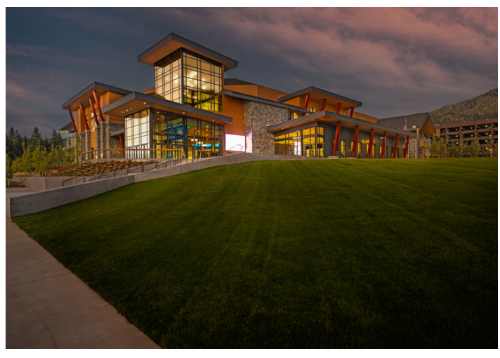
Tahoe Blue Events Center