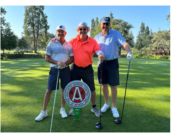
NAPA Golf Tournament