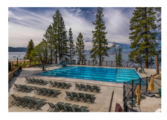
Sustainability & Sensitivity to Environment, History and/or Culture Burnt Cedar Swimming Pool Improvement Project