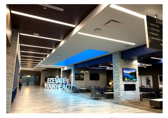
Contractor's Excellence Private Sector Over $1 Million Northern Nevada Sierra Medical Center