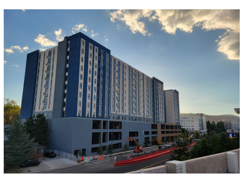
Reno Academy Student Housing