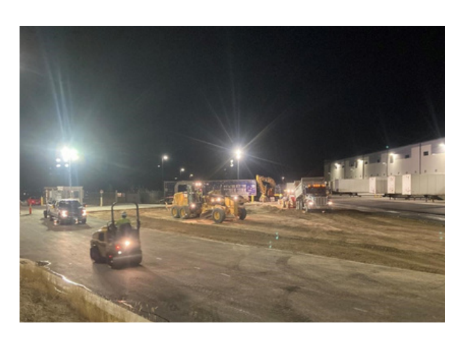
Contractor's Excellence Private Sector Under $10 Million Ontrac Pavement Repair