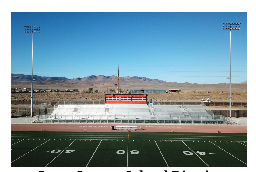
Lyon County School District Bleachers & Lighting