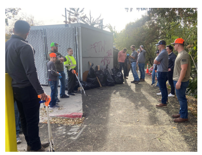
KTMB River Clean-up