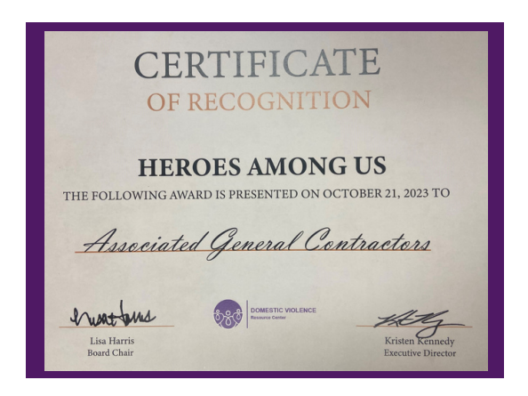
AGC was recognized as a Hero Amoung Us for donating labor and materials to renvovate the flooded Domestic Violence Center.