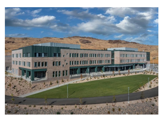
Contractor's Excellence Public Sector Over $10 Million Procter Hug High School