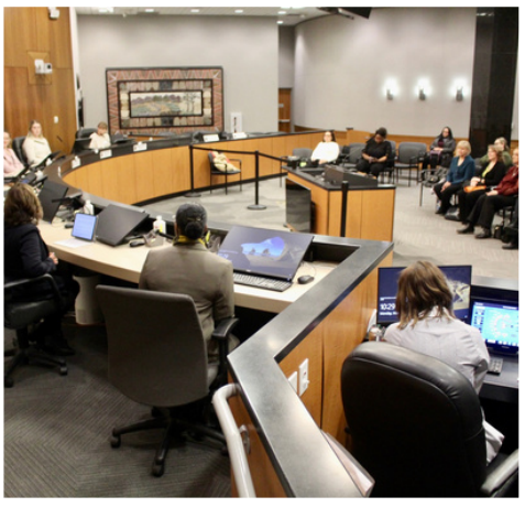
In celebration of Women in Construction Week, AGC members participated in Hammers & Hope, an event where women talk to women about careers in the construction industry.