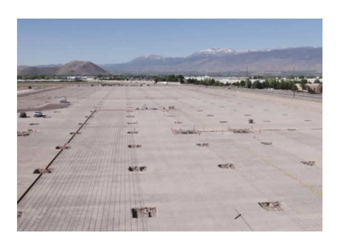
Contractor's Excellence Private Sector Over $10 Million Park at McCarran Industrial Park