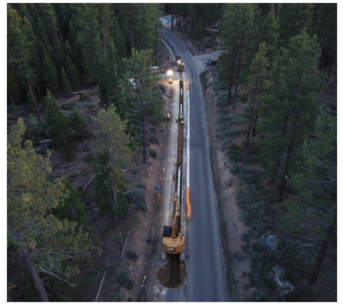
IVGID Effluent Pipe