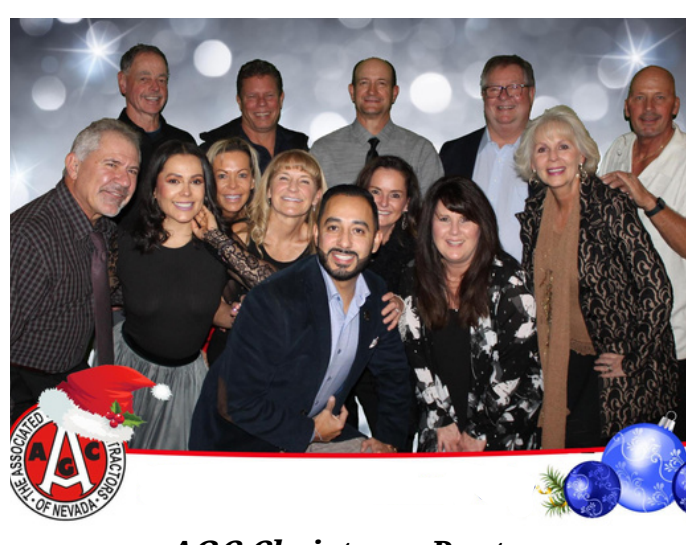
AGC Christmas Party