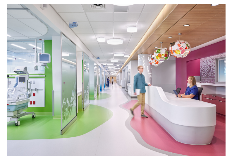
Renown Regional Medical Center Tahoe Tower NICU/PICU