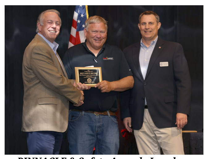
PINNACLE & Safety Awards Luncheon Emceed by: Governor Joe Lombardo