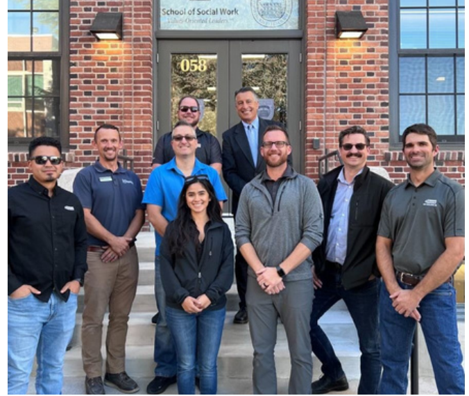
University of Reno, Bldg 58 Radium Decontamination and Remediation