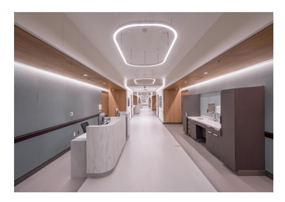
Contractor's Excellence Private Sector Under $10 Million Renown S. Meadows Inpatient Renovation