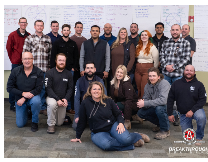
Spring Leadership Series