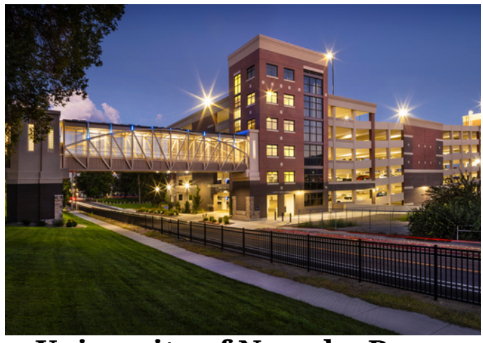
University of Nevada, Reno Gateway Parking Garage