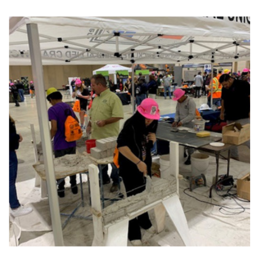
Over 1400 middle & high school students from all over northern Nevada attended AGC's annual Construction Career Day.