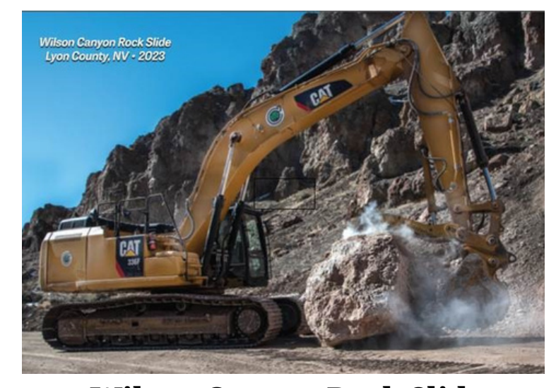
Wilson Canyon Rock Slide