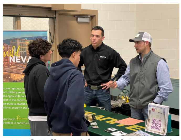
North Valleys High School Career Fair