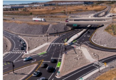
RTC Lemmon Drive Diverging Diamond Interchange